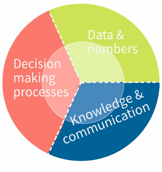
Figure 2: priority fields

These three fields are closely linked at multiple levels. However, each has a distinct focus, and each consists of an internal and external sphere as explained above (and shown in figure 2). The following explanations define the three priority fields and their constituent objectives with respect to both the internal and external spheres.